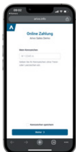
2. Enter license plate number