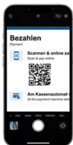
1. Scan QR code